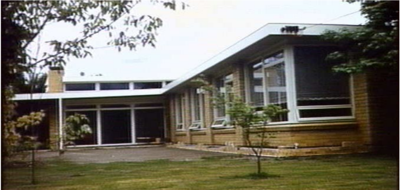
Contemporary photograph of 31 Brewster Street